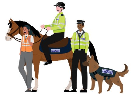
STEWARDS, POLICE, POLICE DOGS & HORSES